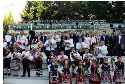
“Krastovden” is a holiday of the orthodox Christianity

“Krastovden” is a holiday of the orthodox Christianity celebrated on the 14th September, as an annual holiday of the Bulgarian town, Silistra. “Krastovden” means “the day of the cross” and is linked to the miraculous appearance of the Holy cross that Emperor Constantine had in 312, the discovery of the cross at Golgotha by his mother Elena, and its return from Persian captivity. The Holiday of Silistra - linked to this religious roots - is also accompanied by a big agricultural fair and art festival - organized since 1861 - that lasts until the 1st October, celebrating the return of South Dobrudzha under Bulgarian rule.