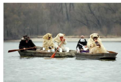
„Busojaras” in Mohacs (Hungary)