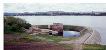
Trajan's Bridge, on a relief of Trajan's Column in Rome and on site (Serbia)