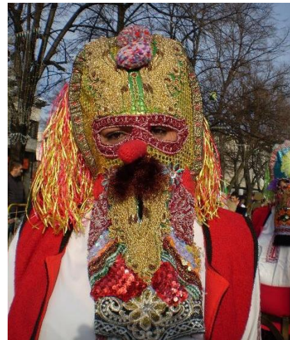
Kukeri festivities in Bulgaria

Kukeri festivities in Bulgaria are a still living Thracian tradition. People wear colorful hand-made costumes and masks, which preparation may take more than a year. The Kukeri masks usually represent animals (rams, goats, bulls, chicken, etc.). Some of the masks have two faces: a good-humored face with a snub nose, and an ominous face with a hooked nose, symbolizing coexistence of Good and Bad. The colors are very important: red symbolizes fertility and sun; black - Mother Earth, white - water and light. They scare evil spirits away by dancing to secure fertility and rich harvest. Kukeri jump, jingle with the bells (they may weight 50 kg) and make jokes.