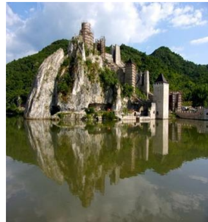
Golubac Fortress (Serbia)

In Bulgaria, today's city of Lom, known as “Artanes” by the Thracians, renamed “Almus” by the Romans who in the year 29th built here a fortress and a big station, which evolved into important port throughout the years. It was called “Almus” by the name of the nearby river which runs into Danube. Later,