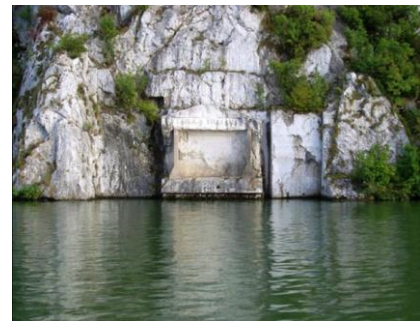
Tabula Traiana (Romania)