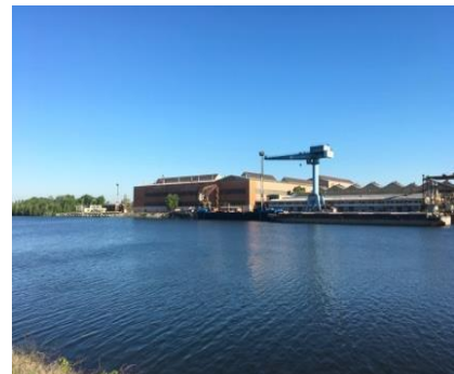
Shipyard, Komarno (Slovakia)

Then, after the great defeat on the Ottoman Empire, Komarom (Komarno) became the main port and basis of the Hungarian fleet as well as centre of shipbuilding (although the first shipyard was built already in the 11th cent.). The new history of shipbuilding began in 1898 when a shiprepair of the MFTR (Magyar Folyam- és Tengerhajózási Részvénytársaság) was established on Elizabeth Island and then it grew to a shipyard in the early 20th century. At present, the area (in Komarno) belongs to Slovakia and used by a private owner as a harbour for small boats and warehouses. However, there is new shipyard in Komarno, opened after WW II, in 1947 of the socialist times, and becoming one of the largest enterprises in Czechoslovakia, selling most of passenger and cargo ships in the communist countries. Since transition, after the Velvet Revolution in 1989, the state-owned company became a joint stock company supplying ships mostly to Western countries.