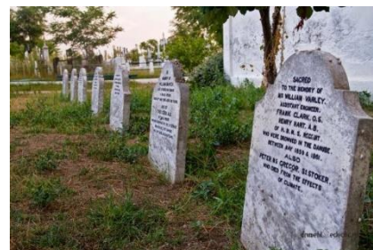
The International Maritime Cemetery, Sulina (Romania)

Finally, a historical - tangible and intangible cultural heritage of the Delta Region - is the Sulina Maritime International Cemetery, a unique place in Europe and the world, where Christians of various denominations, Hebrew and Muslims, are buried together. In the past, Sulina was a large marina, a cosmopolitan city and hosted the European Danube Commission's headquarters. In 1870 it became 'Porto Franco', meaning a free port, absolved from customs duty and having a special treatment. Also, Sulina was the last harbour for dozens of foreigners who now sleep their eternal sleep in the International Maritime Cemetery.