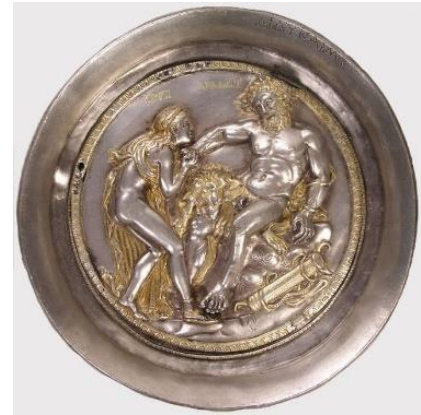
Silver and Gold Phiale Depicting Hercules (Heracles) and Auge, the Rogozen Treasure / 6-4 th century BC, Rogozen (Bulgaria)

So production of wine has been a tradition for the inhabitants on the territory of today's Bulgarian lands and the Lower Danube for many centuries. There are many artefacts, related to wine, determining the spiritual and emotional life of people, living during the times. There are wines that have survived since Thracian times (around 3000 BC.) and are still cultivated industrially and at home vineyards. The Rogozen and Vulchu Tran treasures of Thracians witness the respect and ceremonial usage of the wine. First vines were taken by Thracians from the Middle East to the territory of the present-day Bulgaria. Upon coming to the Balkan Peninsula, the Slavs and the Bulgarians continued the Thracian traditions. Following the imposition of Christianity, the cult of Dionysus was ceased, but the feast related to wine making became Christian and celebrated as Saint Trifon, as the patron saint of the vineyards and winemakers and the related ritual practices for Trifon Zarezan feast continue till today. The main ancient Thracian grape varieties, still grown and having commercial value in the today's Bulgarian Danube plain are "Gamza", "Misket", "Pamid" and "Dimyat".